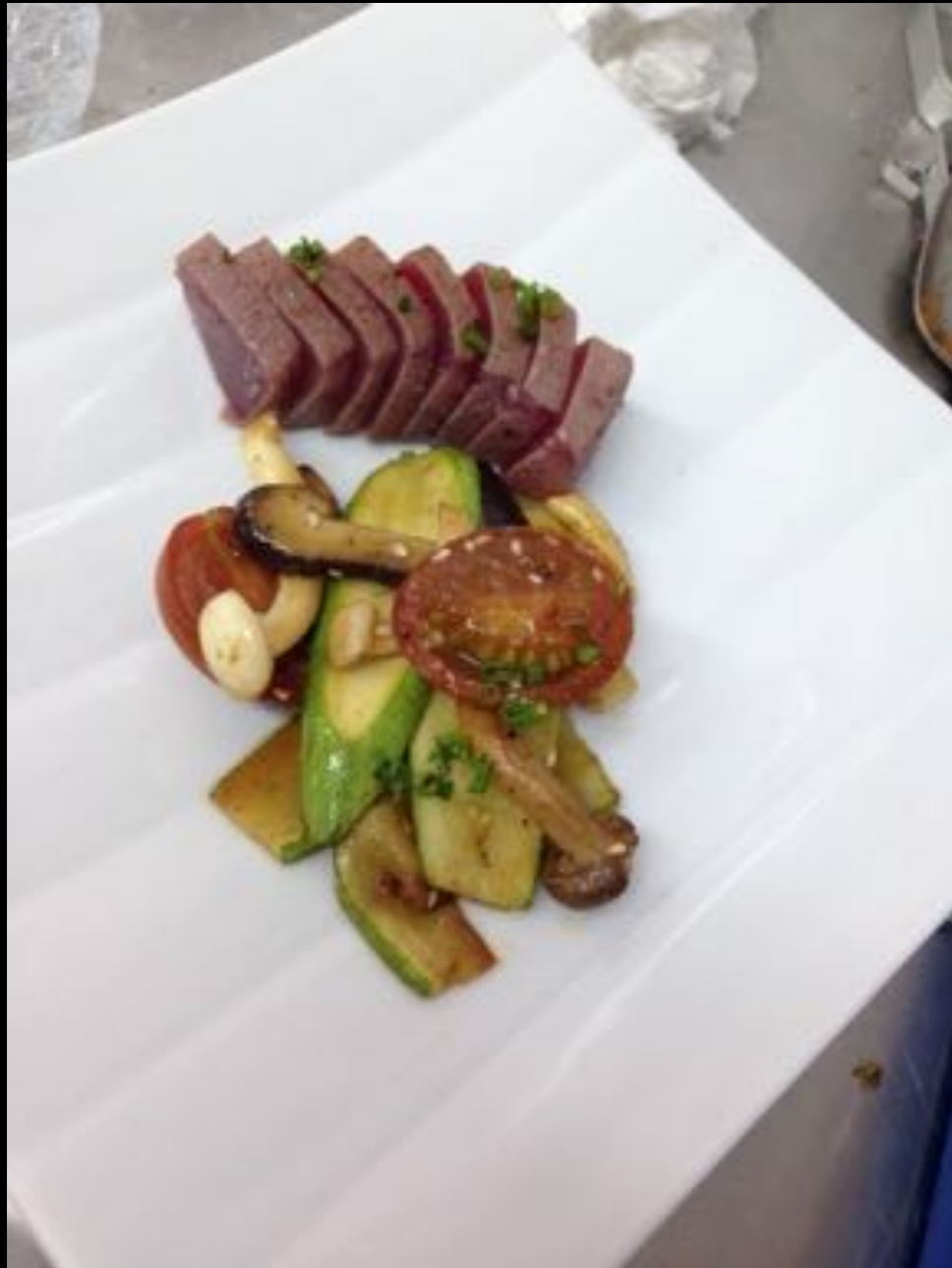
Seared tuna with vegetables