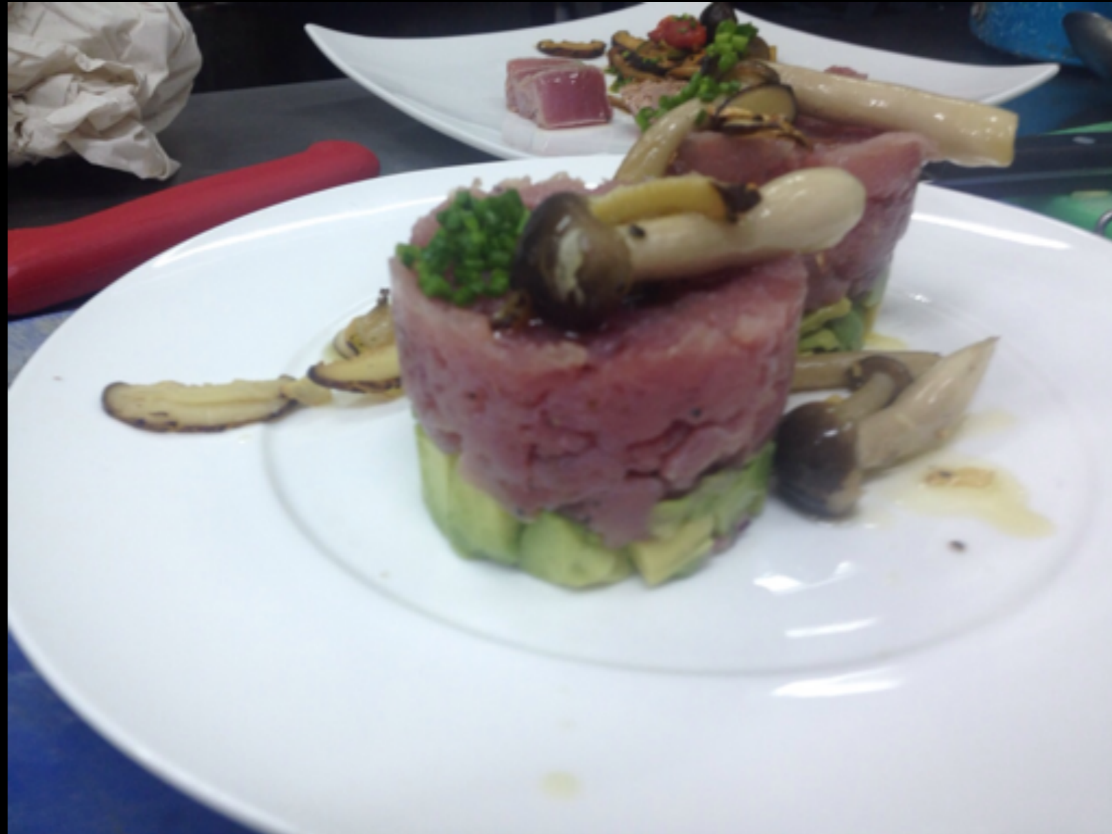
Tuna Tartare with avocado and chanterelle