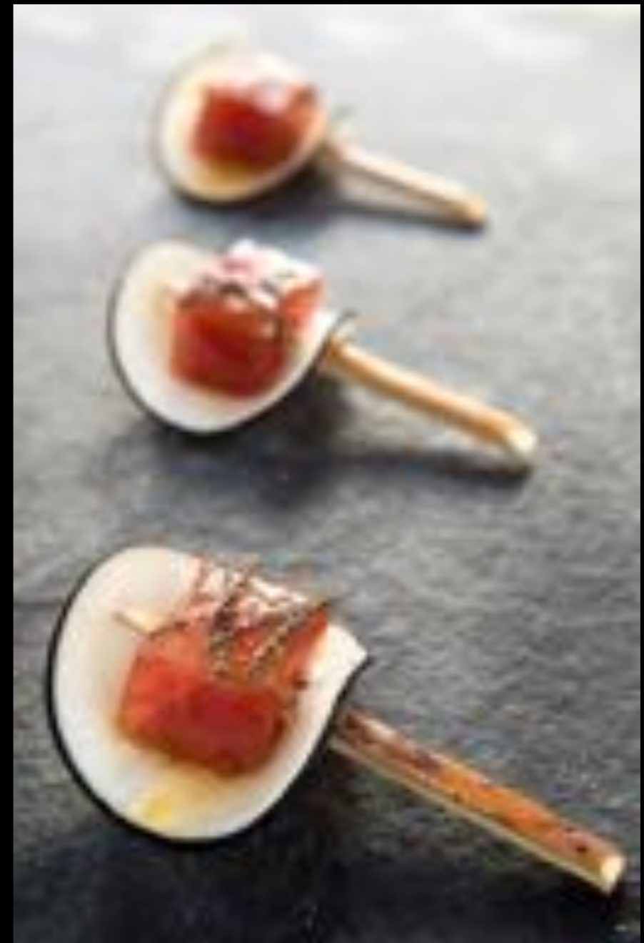
Tuna cubes with radish and passion Fruit