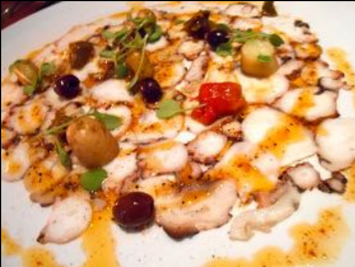
Octopus carpaccio with pimenton and olives