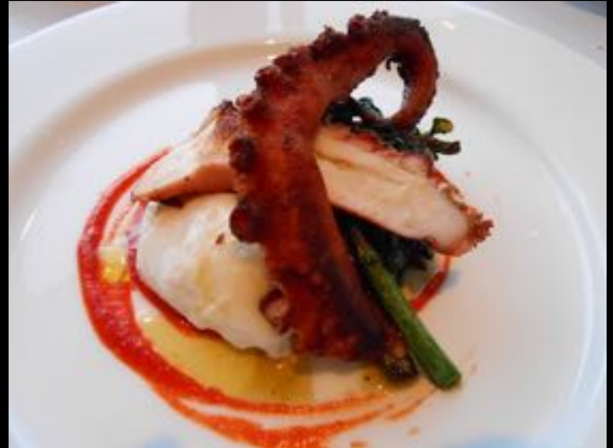
Octopus charred, burrata, broccoli and chile puree