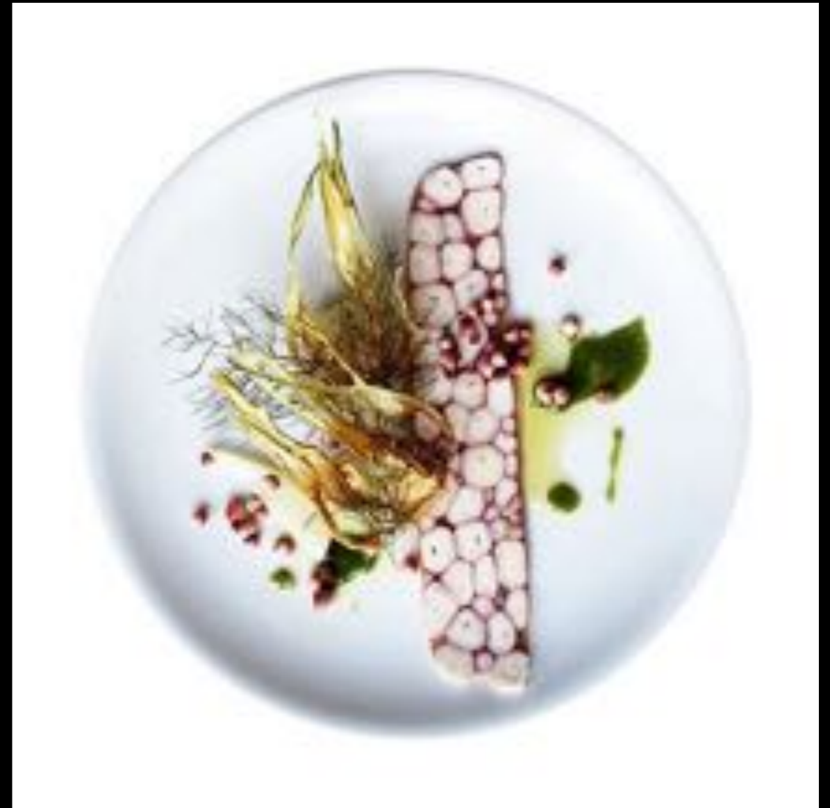
Fennel Octopus Carpaccio