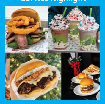
Holiday Food Service Highlight