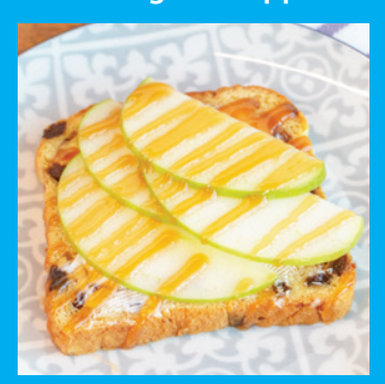
Cooking with Apples