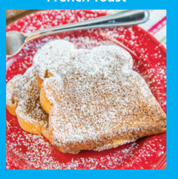
Twelve Days of French Toast